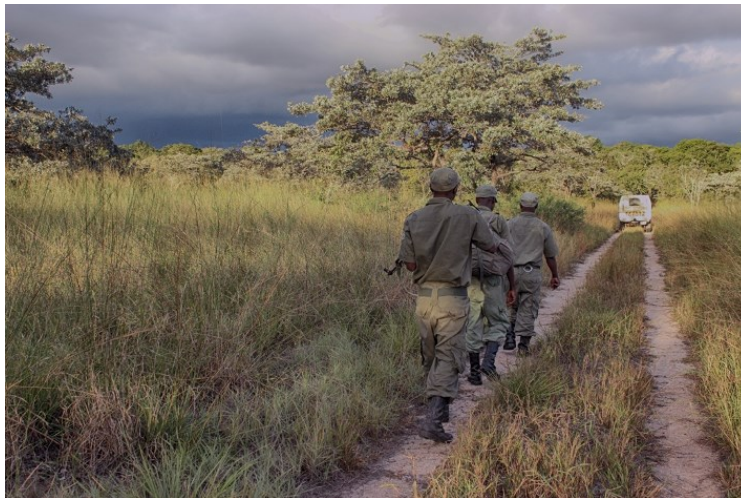
Daily patrol