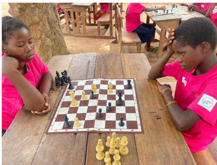
1st Girls' Chess Championship