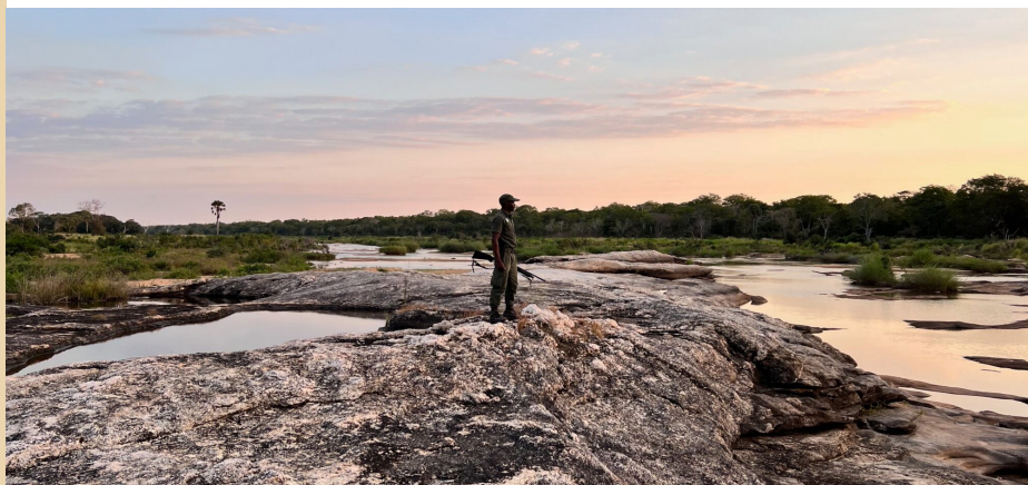
Lice River