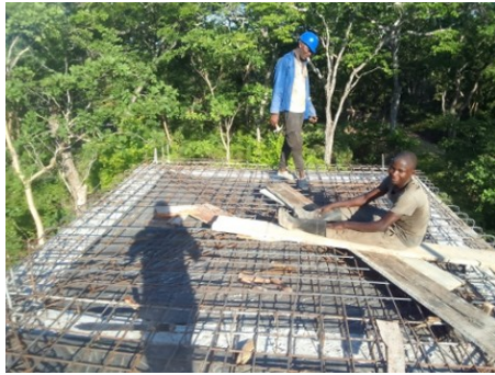
Water tower in the southern border