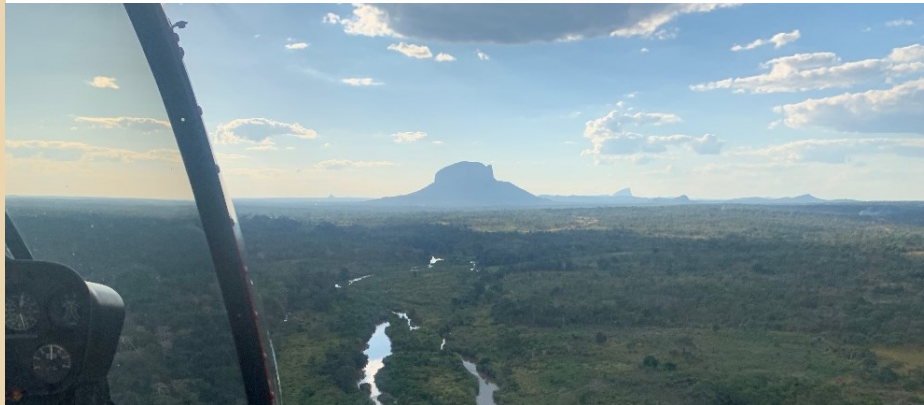
Mt. Pope seen from the helicopter