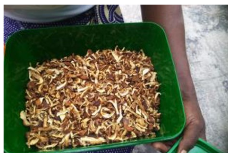
Dried mushrooms