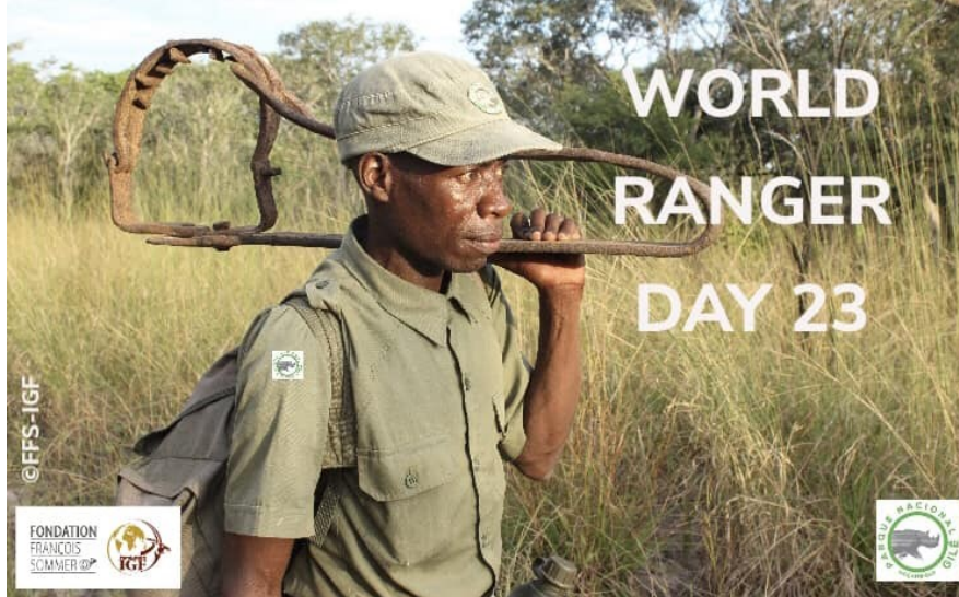
A ranger with one of the confiscated traps