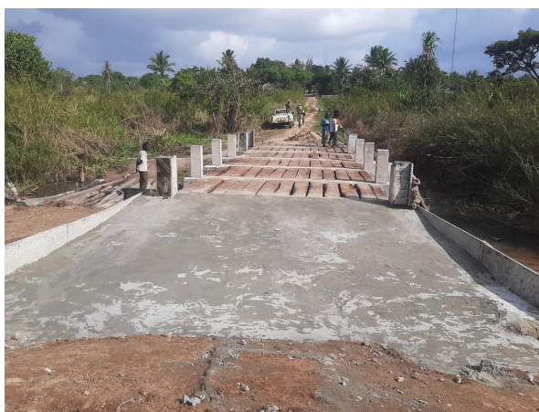
Rehabilitation of the Mulela bridge