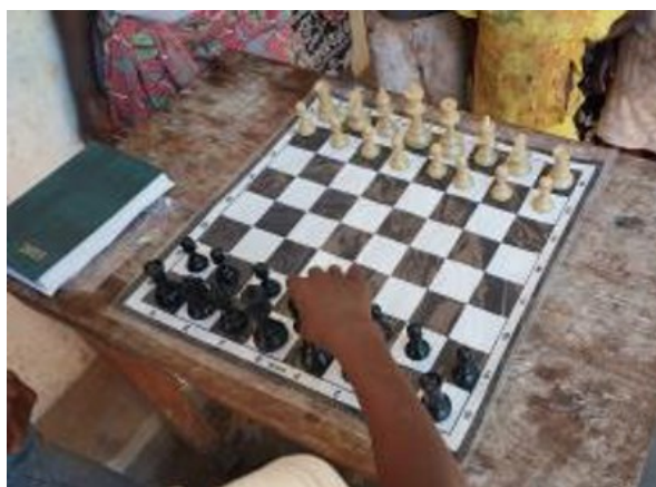
During a chess match