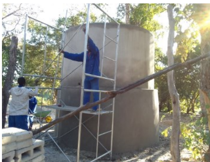
Water tank