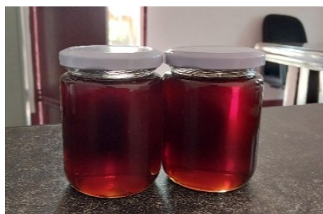
GNAP's honey