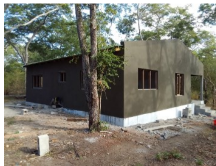
One of the two painted residences ©GNAP