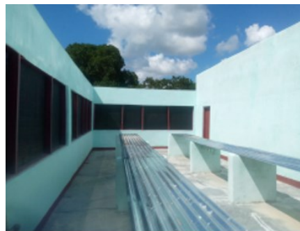
Mujaiane mushroom processing center