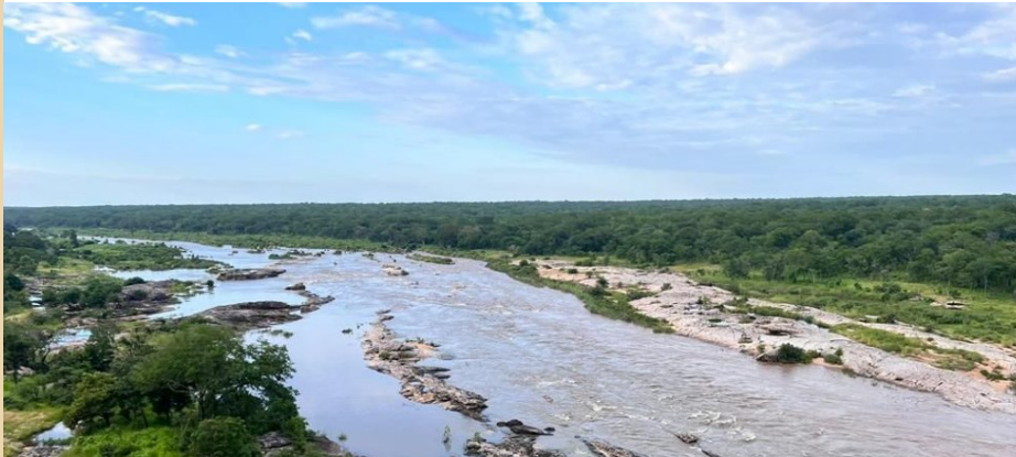
View of Mulela river in front of Lice tourist camp