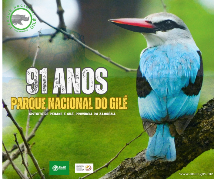
Poster for the GNAP birthday celebration