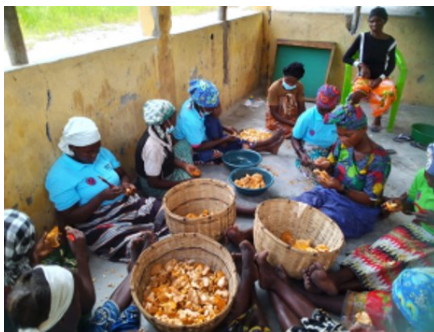
Cleaning mushrooms