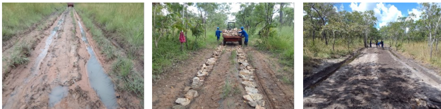
Road rehabilitation

*a type of fence used to enclose livestock in many parts of Africa