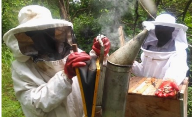
Monitoring beehives